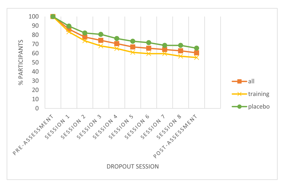
Fig. 2. Dropout curve: percentage of patients by last session in the training, placebo and complete group.