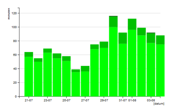
Figure 3: The intensity of movement in minutes per day recorded using the wearable sensor.

From the first pilot, we can conclude that the Hipperbox has the potential to be a portable system for supporting the clients recovering from a hip surgery at home. The system is easy and quick to install and supports different types of data communication. The therapists experienced that the system can facilitate the dialogue with their clients and can support the self-management of the client. More clients and therapists will be involved in the second pilot starting in April 2016. While the focus of the first pilot was on visualization of the sensor data, the second pilot will also provide functionalities to support the communication between the client and the therapist and a feedback system to increase the self-management of the client.