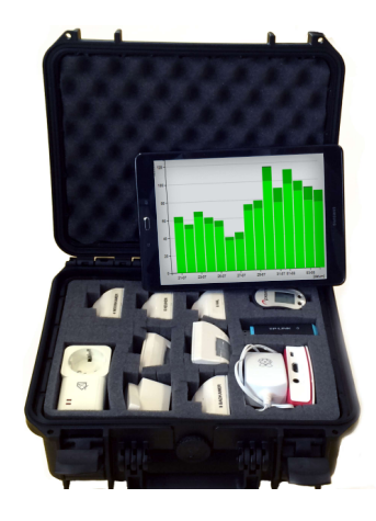
Figure 1: The Hipperbox consisting of a Raspberry Pi, a set of sensors and a tablet.

© 2016 ACM. ISBN 978-1-4503-2138-9. DOI: 10.1145/1235